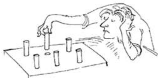
cognitive dissonance experiment turning pegs

Forced compliance occurs when an individual performs an action that is inconsistent with his or her beliefs. The behavior can't be changed, since it was already in the past, so dissonance will need to be reduced by re-evaluating their attitude to what they have done. This prediction has been tested experimentally: